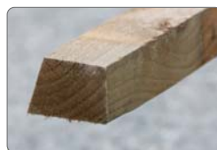
Tanatone® Treated Cant Rail