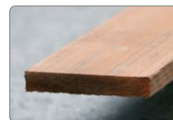
Tanatone® Treated Gravel Board