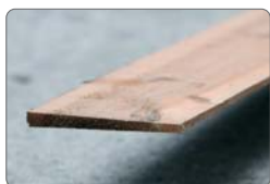
Tanatone® Treated Feather Edge