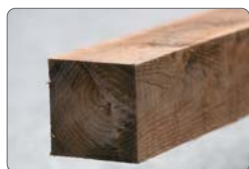
Tanatone® Treated Fence Post

A range of preservative pre-treated (Tanatone® Brown) softwood fencing components