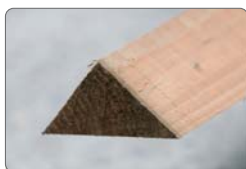
Tanatone® Treated Arris Rail