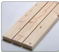
50mm Premium Grade