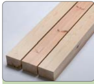
75mm Premium Plus Grade