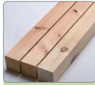
100mm Premium Grade