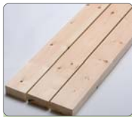
50mm Premium Plus Grade