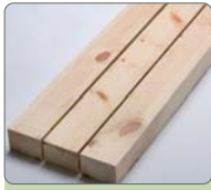
75mm Premium Grade